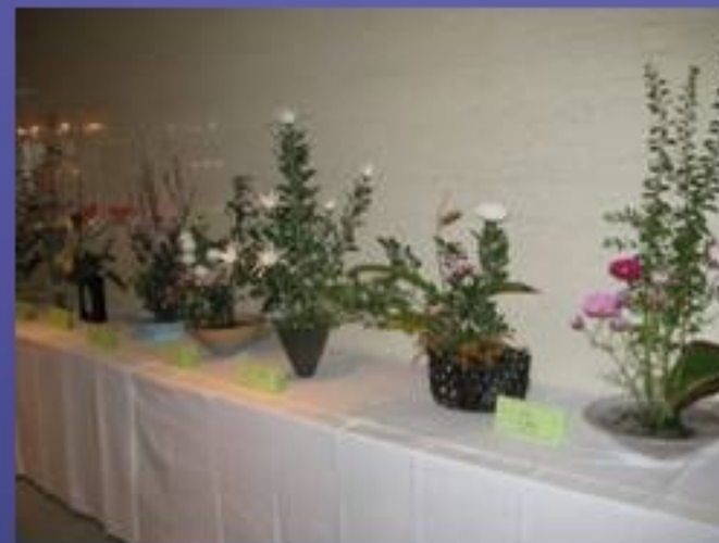
Fruitful output by acc. persons