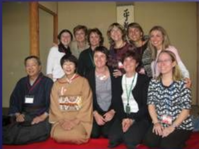
Smile at Tea ceremony

Kobe tour, Nara tour, Himeji tour, Kyoto tour